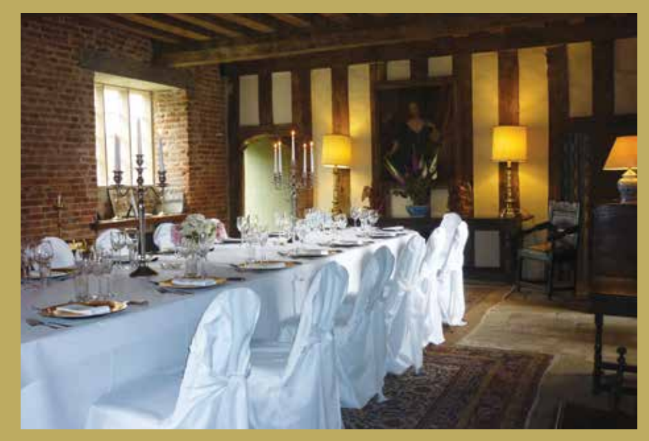
THE MEDIAEVAL LODGINGS

'The setting was absolutely fantastic and contributed greatly to the most perfect day of our lives.'